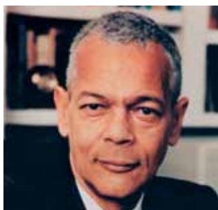
Julian Bond Civil Rights Activist