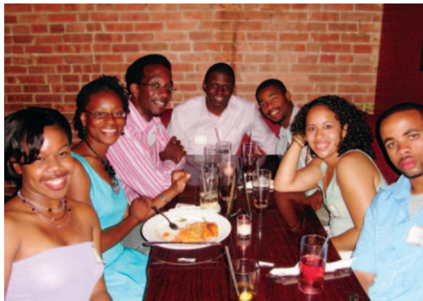
RBS gather at The Den Restaurant in Harlem, New York during the RBS Family Reunion.