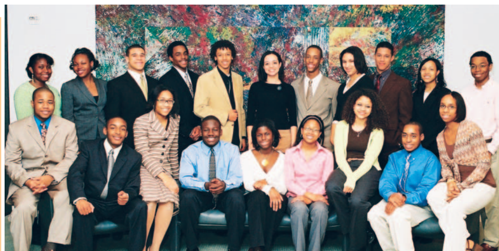
2006 Ron Brown Scholars take a time-out during Selection Weekend to pose for a group photo.