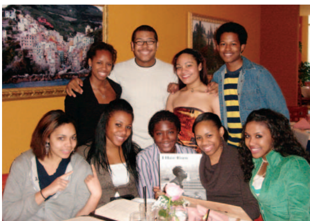
Yale Scholars gather for an evening of fellowship.