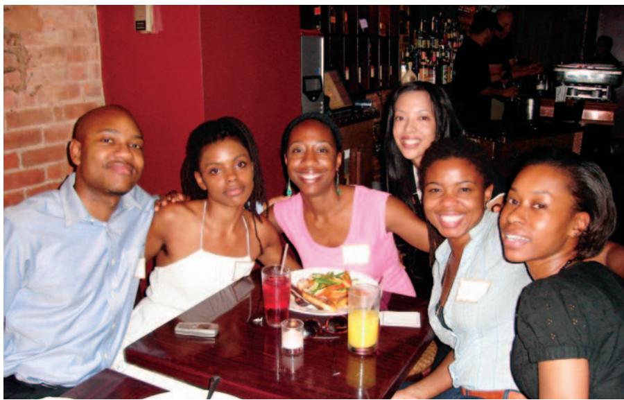
RBS Alumni gather during the 1st Annual RBS Family Reunion, August 4, 2006.

In addition to our efforts to keep the Alumni together through social and service activities, our primary goal as the Alumni Association is to become an endowed philanthropic organization with the financial ability to offer grants, change lives, and give back to our communities for a long time.