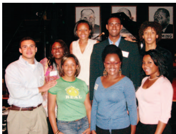
Scholars gather for a book signing at Busboys and Poets Books in Washington, DC.